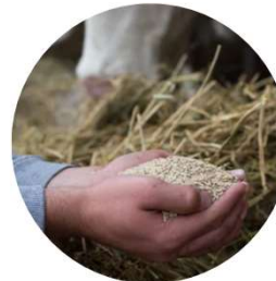
Animal Feed Industry